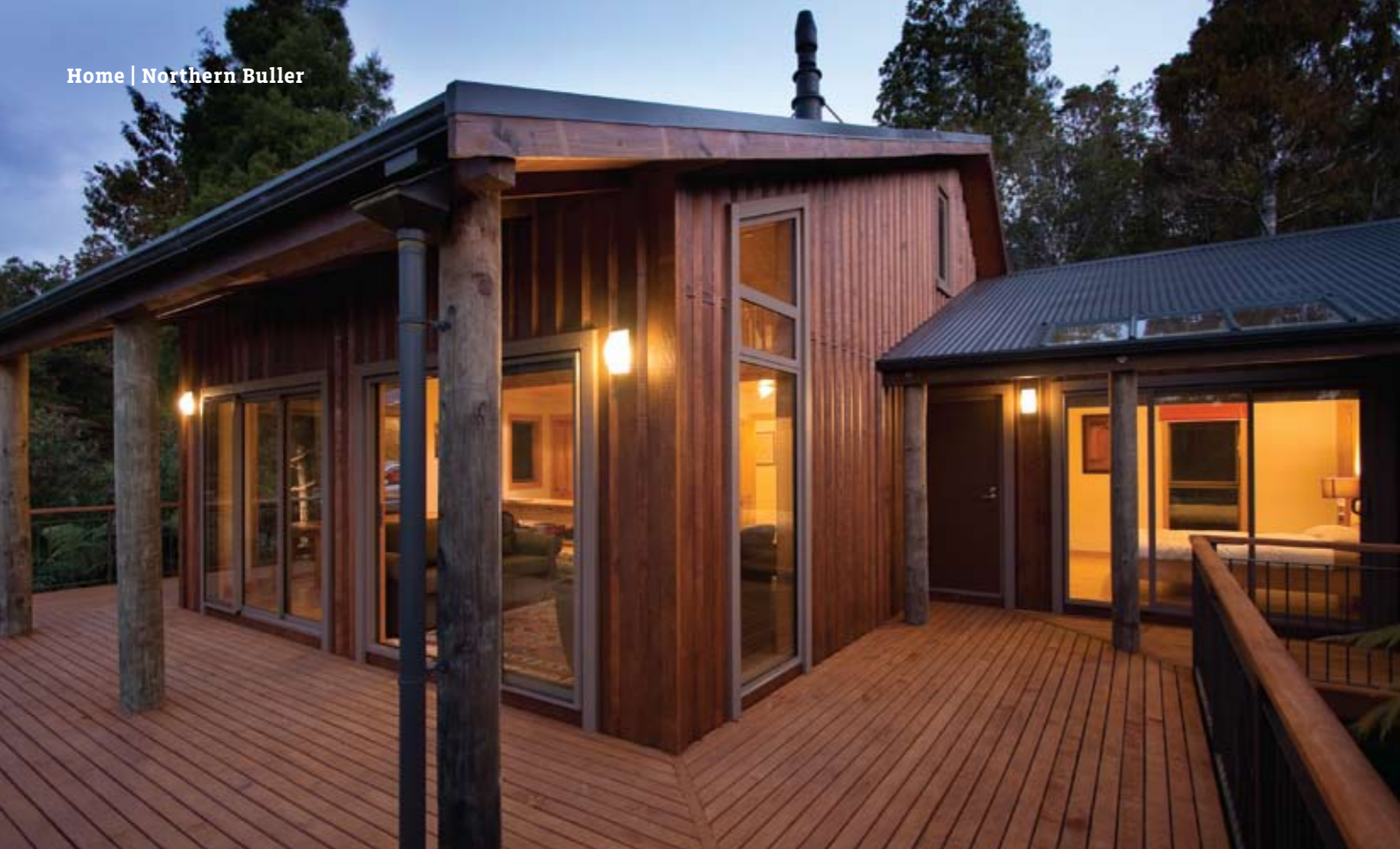
The design of the bach was influenced by the concept of a classic cabin, to create a special, camping inspired holiday theme.