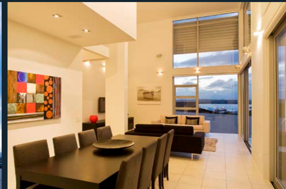
WINDOWS & DOORS: APL Metro Series supplied by Able Aluminium in Silver Pearl powder coat. PRODUCTS USED: Awning windows, fixed lights, sliding doors.