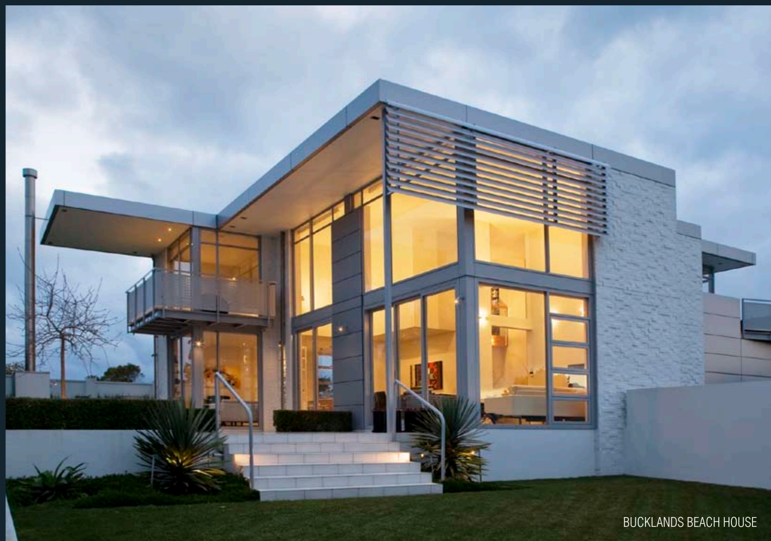
BUCKLANDS BEACH HOUSE