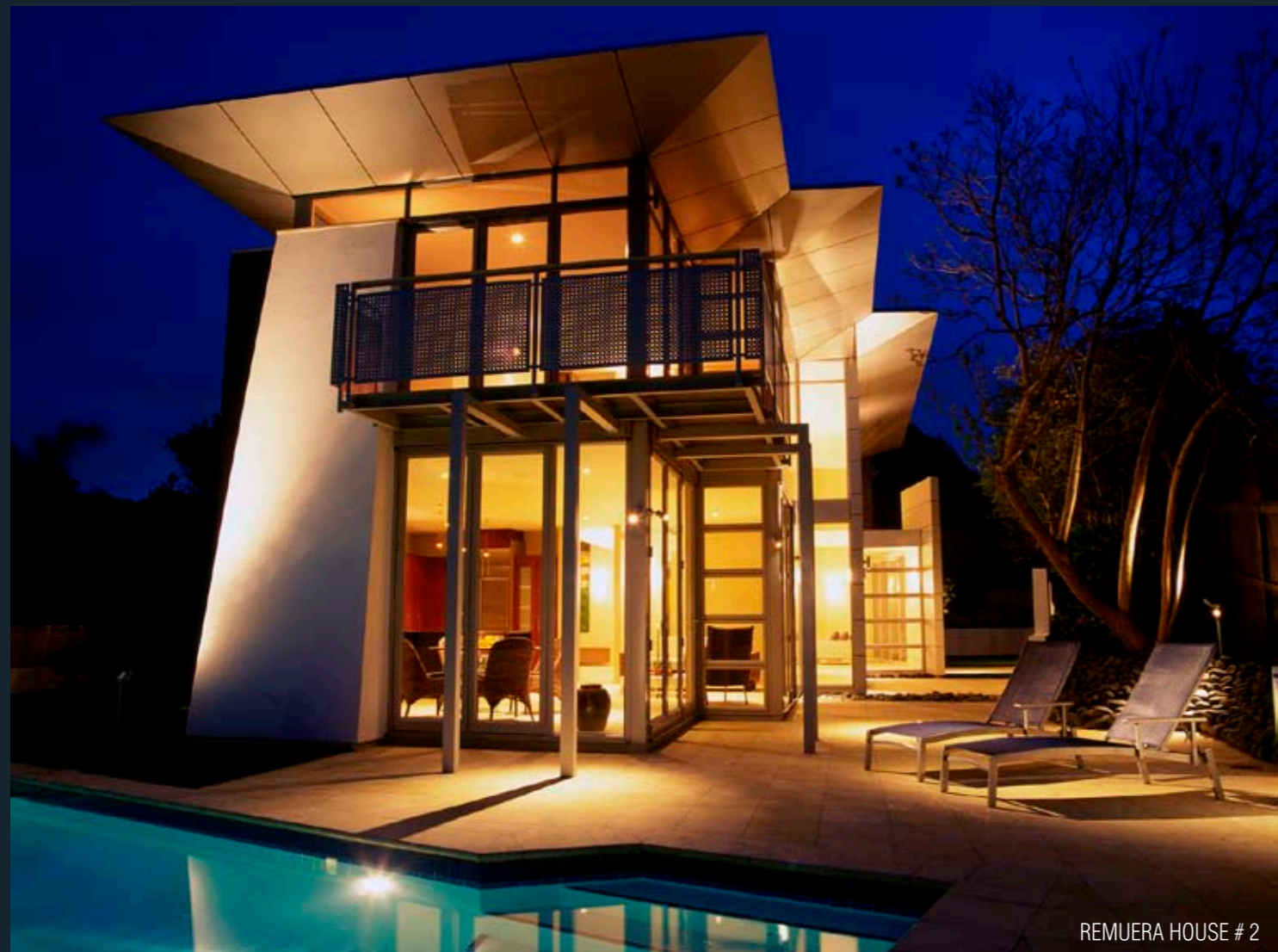
REMUERA HOUSE # 2