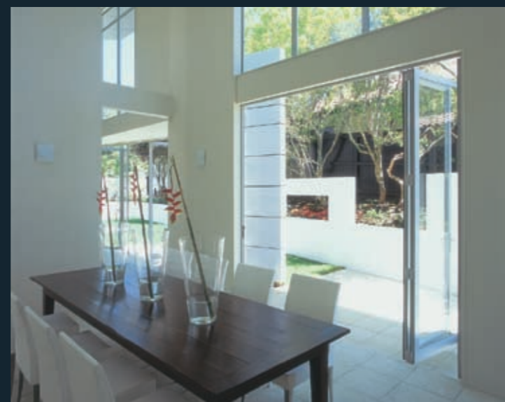
WINDOWS & DOORS: Altherm residential supplied by Altherm Aluminium West Auckland in Silver Pearl powder coat. PRODUCTS USED: Awning windows, fixed lights, bi-fold doors, hinged doors, overhead glazing.